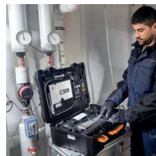
Automatic tightness test