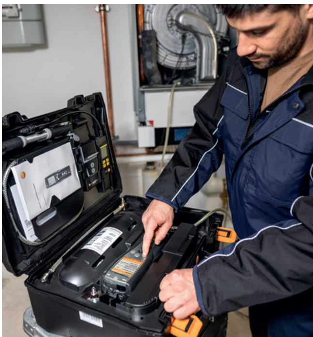
Automatic servicability test with gas-feed appliance with connection to the gas boiler