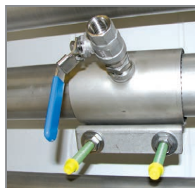
B Spot drilling collar