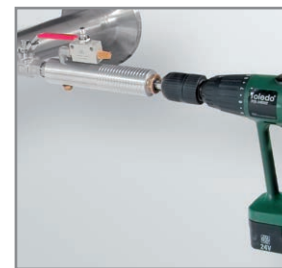
Drill under pressure with the CS Drill

3) Due to the large measuring range of the probe even extreme requirements to the flow measurement (high volume flow in small pipe diameters) can be met.