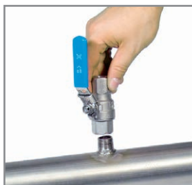
A Screw neck

Drill holes can be drilled through the 1/2" ball valve into the existing tubing with the help of the drilling device, the drill chips are collected in a filter, then the probe is installed as described under 1).