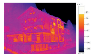
Thermal image with ScaleAssist