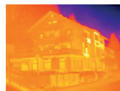
Thermal image without ScaleAssist

Since the temperature scale and colouring of thermal images can be adapted individually, it is possible that the thermal behaviour of a building, for example, can be wrongly interpreted. The testo ScaleAssist function solves this problem by adjusting the colour distribution of the scale to the interior and exterior temperature of the measurement object and the difference between them. This ensures objectively comparable and error-free thermal images.