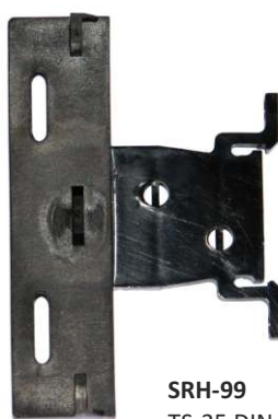
SRH-99 TS-35 DIN rail brackets for 96 x 96 mm case