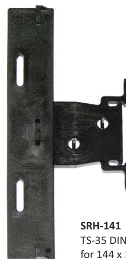
SRH-141 TS-35 DIN rail brackets for 144 x 144 mm case