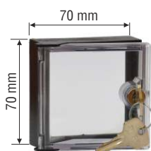
STD-77 transparent IP 54 door with lock for 72 x 72 mm case