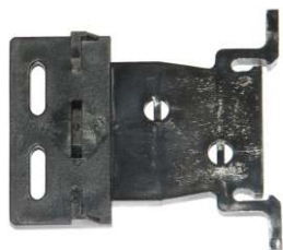
SRH-94 TS-35 DIN rail brackets for 96 x 48 mm case