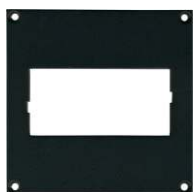
SMP-99/94 to mount 96 x 48 mm size unit in place of 96 x 96 mm cut-out