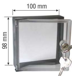
STD-99 transparent IP 54 door with lock for 96 x 96 mm case