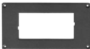
SMP-147/94 to mount 96 x 48 mm size unit in place of 144 x 72 mm cut-out