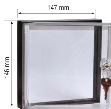
STD-141 transparent IP 54 door with lock for 144 x 144 mm case

Transparent door with moulded frame acc. to DIN 43700, lockable with security key. Door and frame are made by injection moulding thus assuring an exact fit, an optimal choice of a material which is very strong and with no risk of corrosion; perfect seal-protective system IP 54 provided by all-round soft rubber sealing the moulding; door does not swing in or out sideways on opening; door-frame and frontframe can be exchanged.