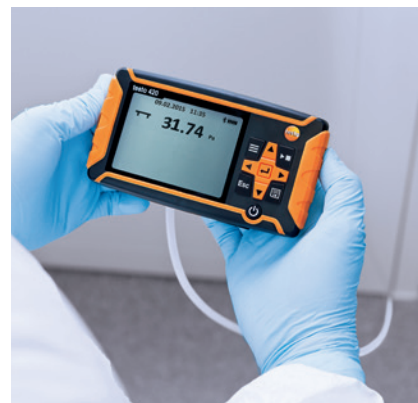
Differential pressure measurement with connection hose